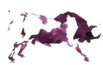
RED WINE VALLE DE COLCHAGUA CHILE